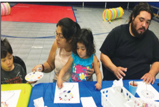
Talent comes out at Saturday Clubs.