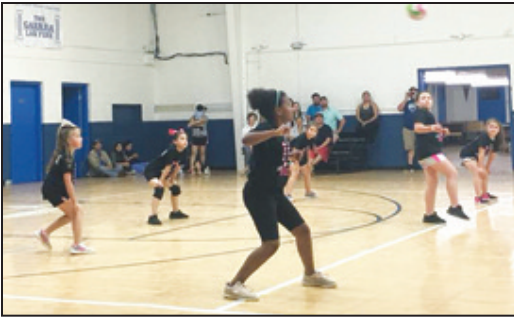
The Spring Little Spikers volleyball league was sponsored again by the Garriga Law Firm.