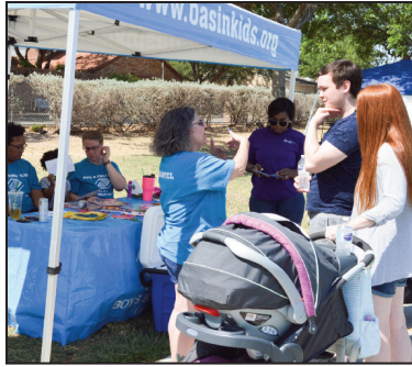
Families pick up information at participating booths.

Giving families an opportunity to spend time together and have some fun was a goal of the Second Annual Roll & Read. This interactive walk and stroller tour of literacy and health stations for the entire family was held in May at Memorial Gardens Park for Odessa and Midland. Kids came on bikes, roller blades or in decorated strollers and enjoyed fun activities at 22 booths. Parents, meanwhile, picked up information about staying healthy.