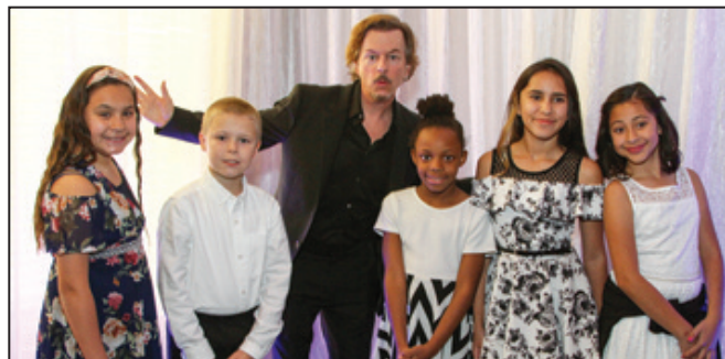
Comedian David Spade, center, chats with some Boys & Girls Club members prior to his performance.