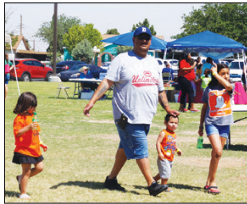
Dads enjoyed the opportunity to create memories with their kids.

The Boys & Girls Clubs in the Permian Basin provided a fun place to go and activities to share when the group hosted an event with UTPB's Fatherhood Engagement Program. Families ran, jumped, slid, bounced, dunked, and played together. Fathers commented they were grateful to have the event to spend time with their children and create memories.